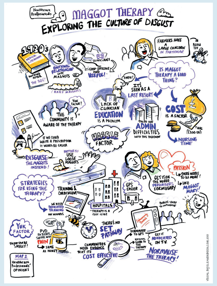
Fig 3. Graphic representation of discussion and issues raised in nursing focus group on maggot therapy

Barbados and Canada). There was a varied range of ages although 54.4% of participants were aged between 40–59 years. Most (91.3%) participants identified as female. All of the WS nurses had heard of MT, and 97% of NWS nurses had heard of MT. Tables 1a and 1b summarise responses obtained from WS and NWS nurses, respectively, for a series of statements on the usage and perceptions of MT. Sporadically, a participant omitted to respond to a particular statement, so final percentages were worked out on the total number of responses obtained for each statement.